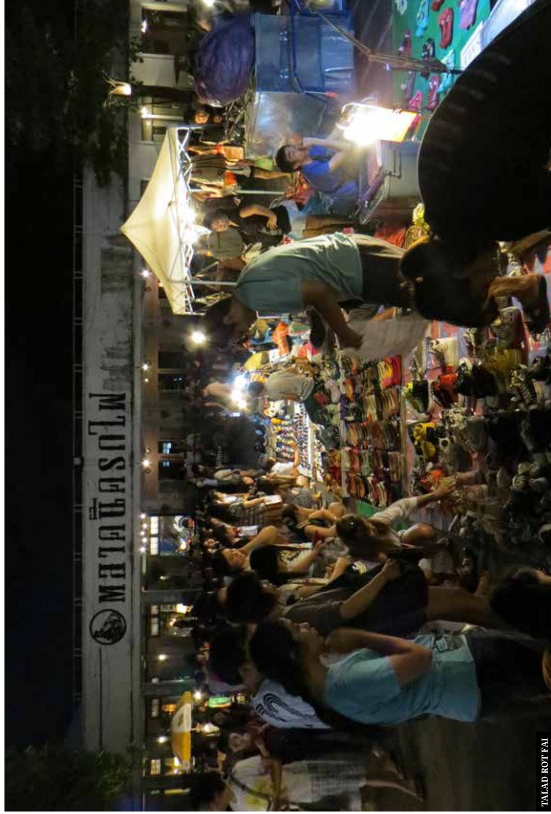
TALAD ROT FAI