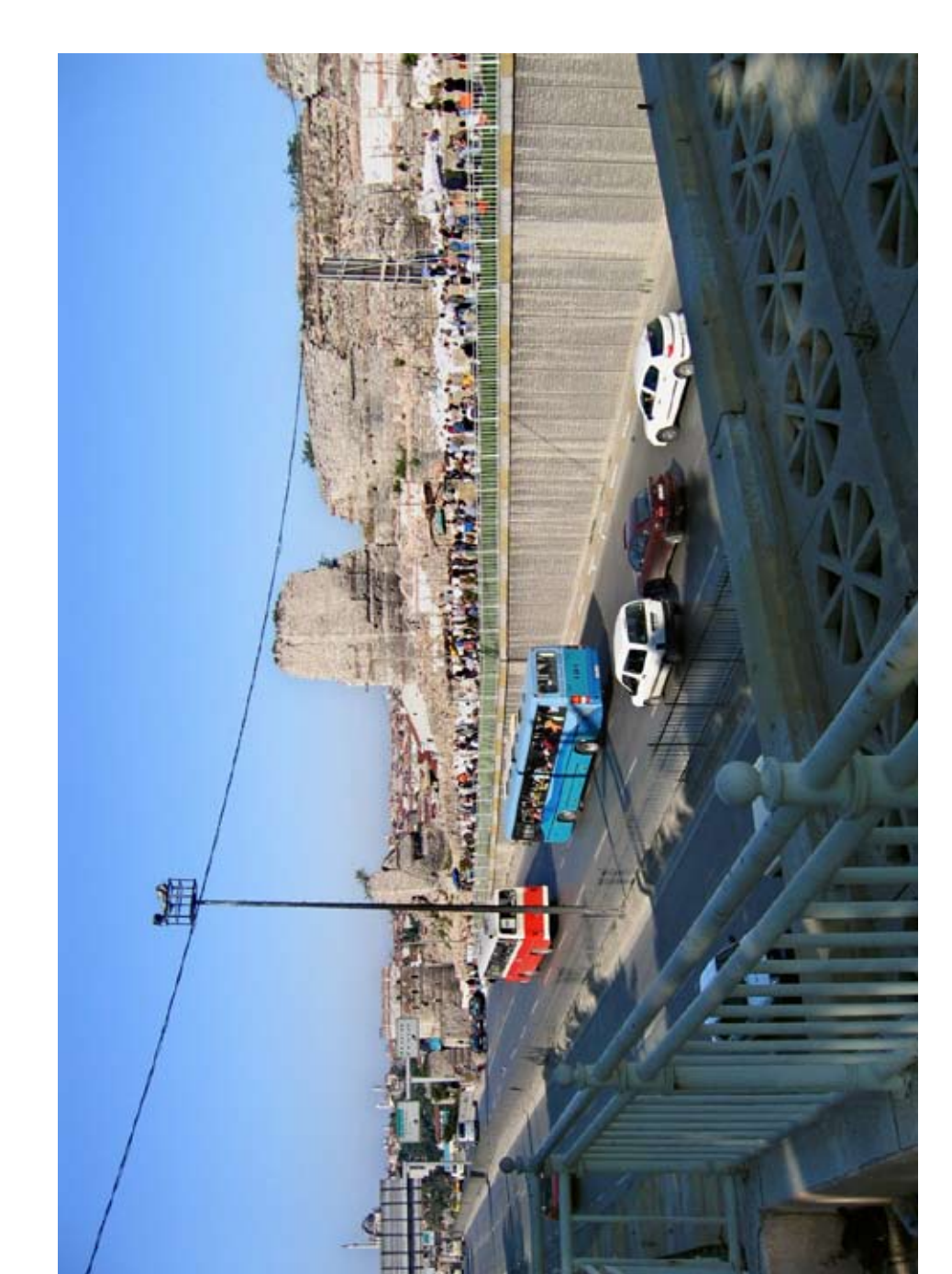
formal market along the Byzantine city walls and Londra Asfaltı, an arterial road to the west, Istanbul